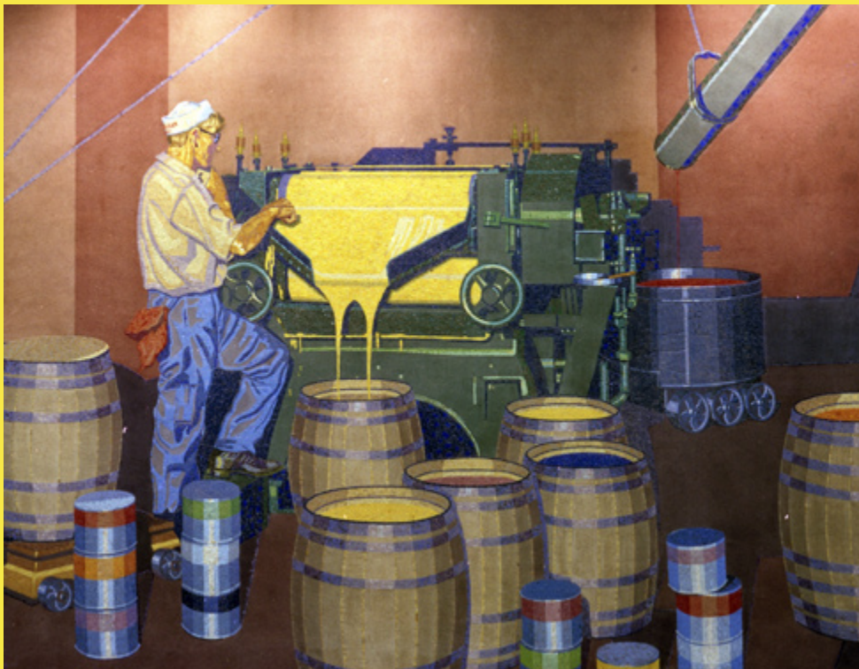
Figure 1. Detail from Weinold Reiss' Cincinnati Union Terminal Mural. This panel was one of 14 mosaics, which were moved to the Northern Kentucky/Greater Cincinnati International Airport in the 1970s before Union Terminal's concourse was destroyed.

I didn't know my grandfather; he died before I was born. But I did know a particular image of him. As a child, I used to visit a mural that was part of Weinold Reiss' magnificent Cincinnati Union Terminal suite. There, my grandfather, who had posed for Reiss, stood at the controls of a big green mixing machine with the most beautiful yellow liquid flowing into the barrels below.